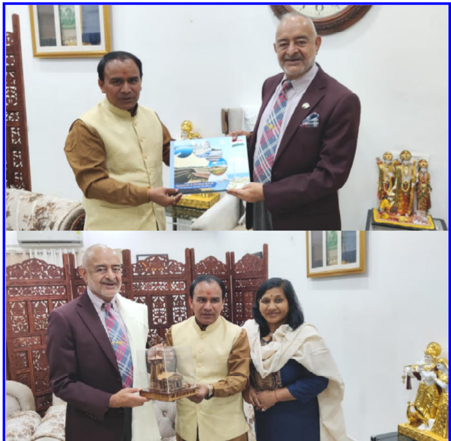
Admiral D K Joshi, PVSM, AVSM, YSM, NM, VSM (Retd.), Hon'ble Lt. Governor, A&N Islands and Vice-Chairman, Islands Development Agency on visit to Dehradun for the 6 th World Congress Disaster Management 2023 met Dr. Dhan Singh Rawat, Hon'ble Minister of Health, Education and Cooperative, Government of Uttarakhand. Steps to strengthen Health and Education infrastructure were discussed.

the 'Rozgar Mela' to be held at DBRAIT Auditorium on 30 th November, 2023 (Thursday) and will receive the Offer of Appointment Letters on the occasion. Candidates have been requested to be seated at 2.30 pm positively, a press release from Special Secretary (Personnel) said.